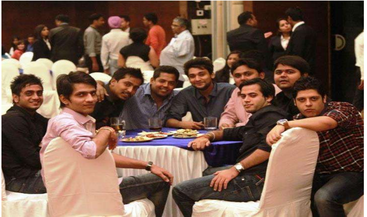
Alumni Chapter Meet 1