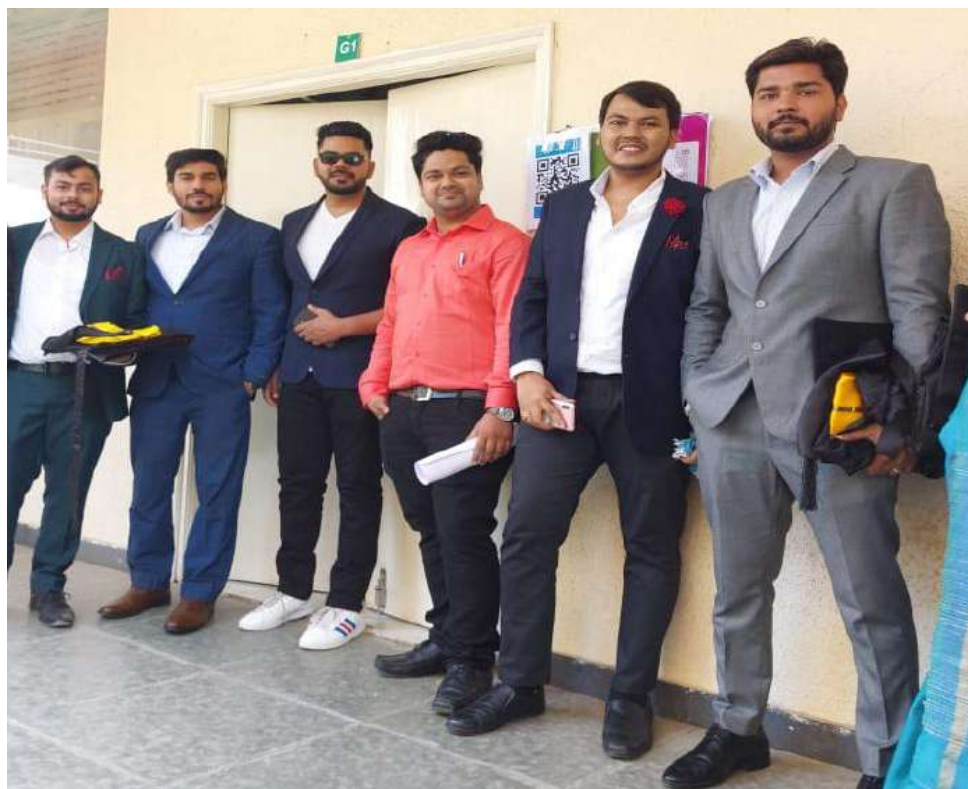
Alumni Chapter Meet 2