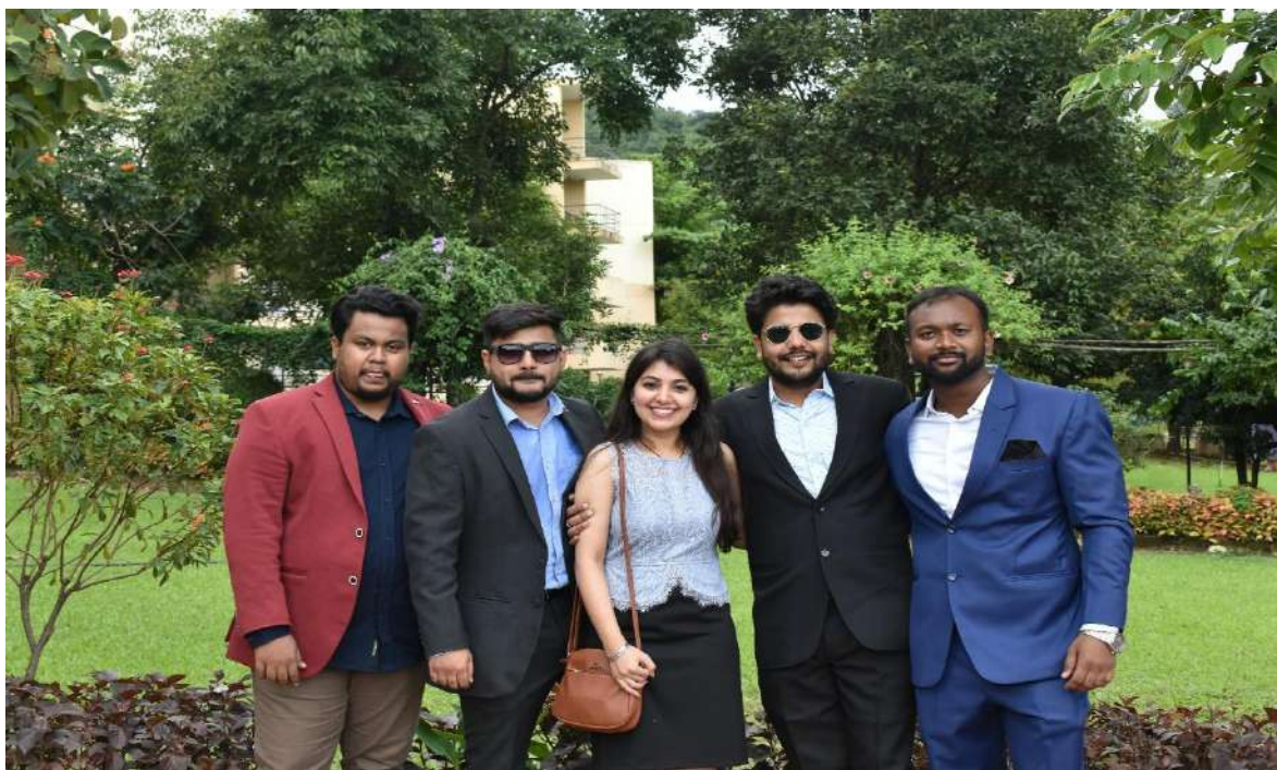
Alumni Chapter Meet 5