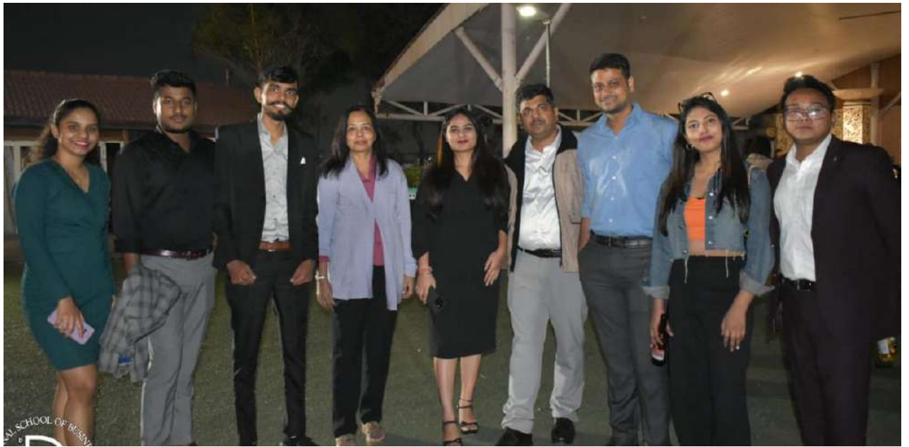
Alumni Chapter Meet 4