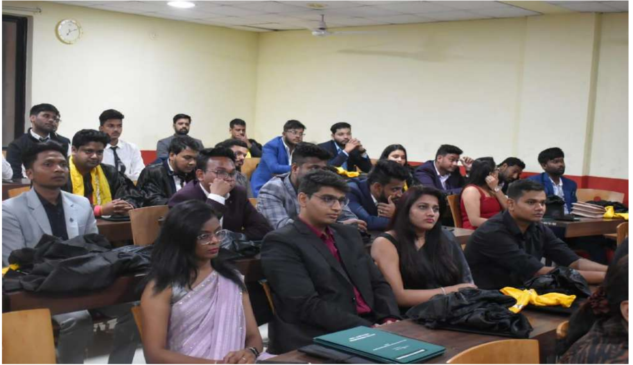
Alumni Chapter Meet 3